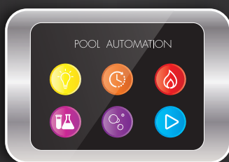
POOL CONTROLLER COMPATIBLE*